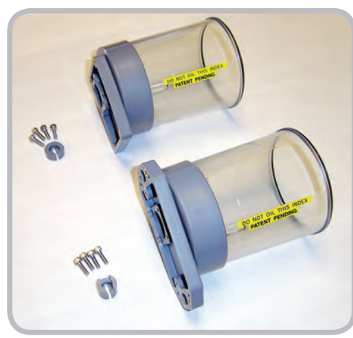
AMR Adapters for Dresser Series B3 meter