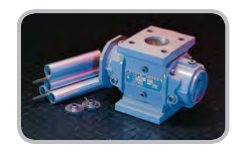
Dresser Series B meter bodies accept a wide range of Series 3 accessories for all metering applications

Dresser meters are manufactured in accordance with ANSI B109.3 for Rotary Type Gas Displacement Meters. Dresser Series B3 meter sizes 8C through 56M, have flanged inlet and outlet connections conforming dimensionally with ANSI/ASME standards. Sizes 8C through 2M are available with 1-1/2" NPT connections, upon special request. The meter operating temperature range is from -40°F to +140°F (-40°C to +60°C) while the temperature compensating mechanism of the mechanical TC accessory provides a corrected reading for temperatures ranging from -20°F to +120°F (-29°C to +49°C).